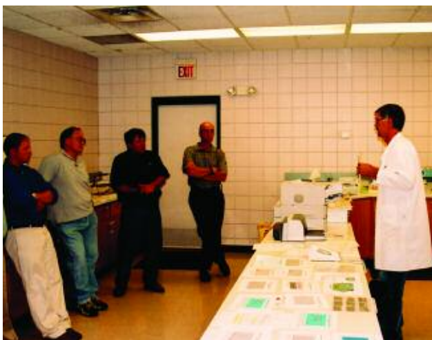
DMWW senior chemist talks about what he has seen from sample analysis.